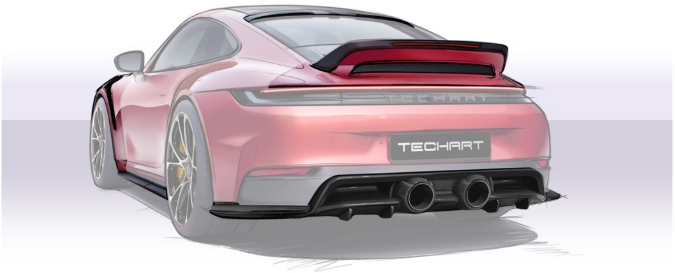
Image 4: TECHART Aero Kit & Heckspoiler III on 911 (992.2) GTS

Each carbon part is available in glossy or matte finish and embodies TECHART's uncompromising approach to design, quality and attention to detail.