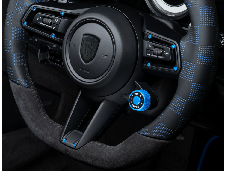
Image 6: TECHART Steering Wheel Individualization for 911 (992.2)

Carbon trim elements and painted inlays further enhance the interior architecture. Every material, surface, and accent can be tailored to the driver's vision - creating an environment that feels as exclusive as it looks.