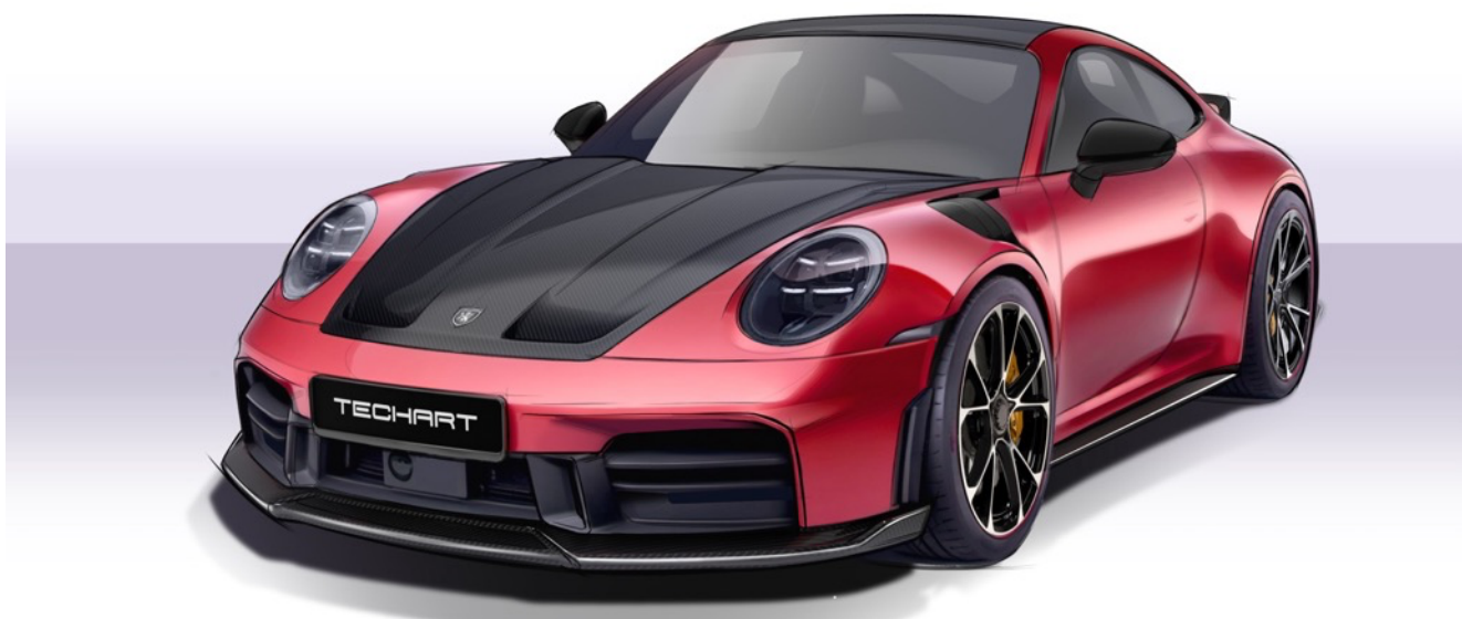
Image 1: TECHART Aero Kit on 911 (992.2) Carrera

Where others see a sports car, TECHART sees a canvas. A place for individuality, performance, and unmatched character. With over three decades of expertise in high-end Porsche refinement, TECHART now unlocks a new level of personalization for the 911 (992.2) - combining motorsport-inspired design with craftsmanship, technology, and bold expression.