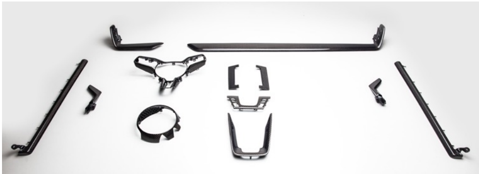
Image 7: TECHART Carbon Interior Package for 911 (992.2)

Carbon trim elements and painted inlays further enhance the interior architecture. Every material, surface, and accent can be tailored to the driver's vision - creating an environment that feels as exclusive as it looks.