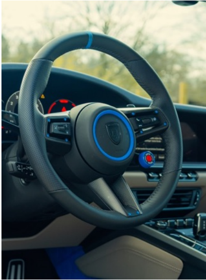
Image 5: TECHART Steering Wheel Individualization for 911 (992.2)

On the inside, the 911 becomes a personal canvas. TECHART's in-house saddlery transforms the interior with handcrafted details - from custom leather and Alcantara applications to unique contrast stitching and bespoke perforation patterns.