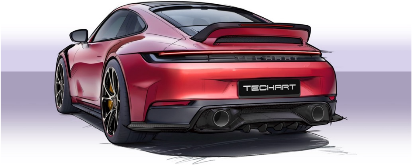
Image 2: TECHART Aero Kit & Heckspoiler III on 911 (992.2) Carrera