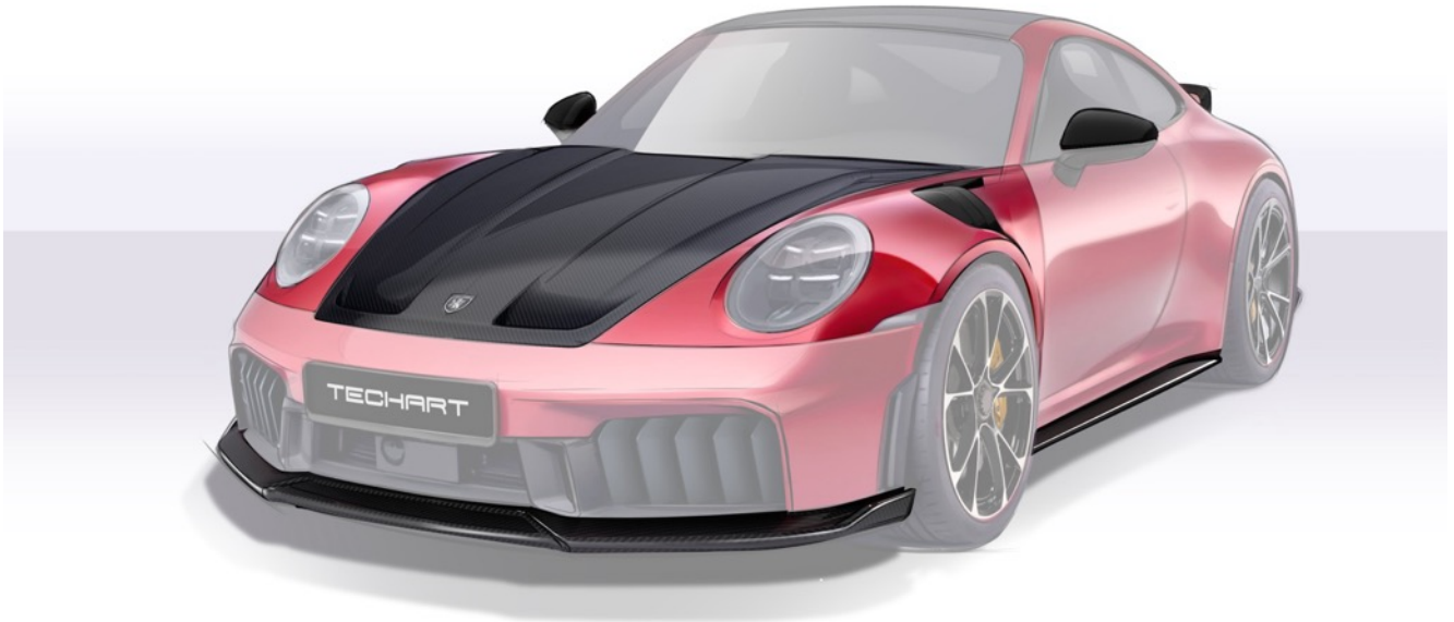
Image 3: TECHART Aero Kit on 911 (992.2) GTS