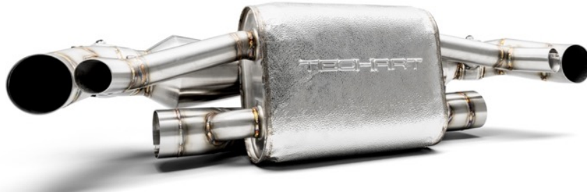
Image 10: TECHART Sports Exhaust System for 911 (992.2) Carrera and Carrera S

True performance speaks. But with the TECHART Sport Exhaust System, it roars.